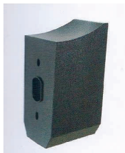
PM860RP Round Pole Adapter