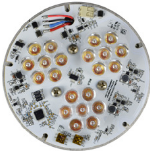
GTSOLM21-AMB Module Off