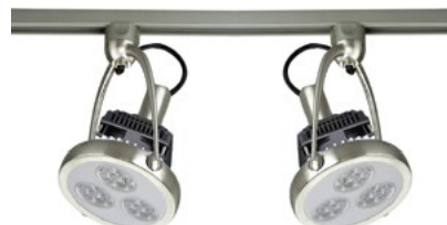
Mini AC in a Track Lighting Applicatio