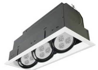
Mini AC in a 3 Lamp Combo Fixture