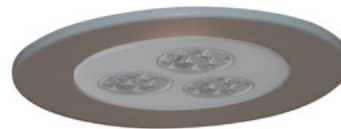
Mini AC in a Recessed Can Applicatio