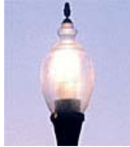
Borosilicate glass refractors