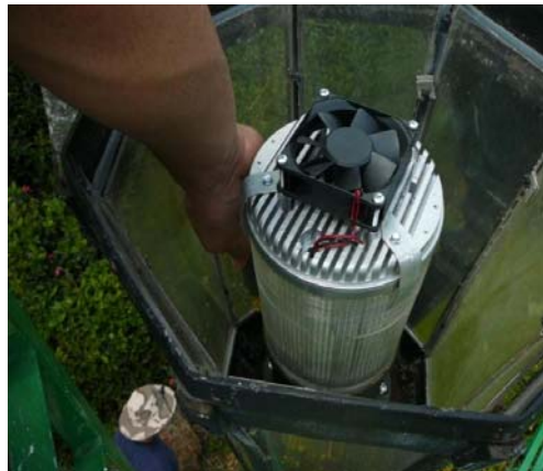
Kit installed onto existing refractor